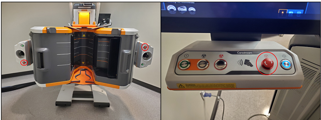
Figure 1: Emergency Stop buttons located on the gantry and on the operators' console.